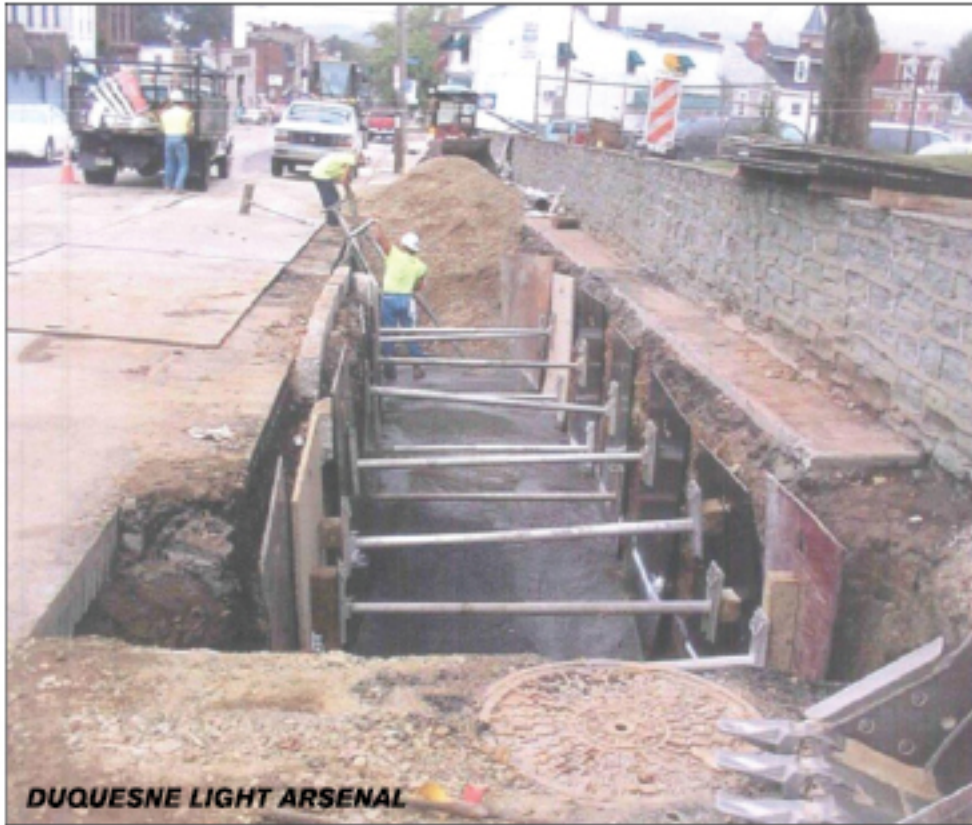
DUQUESNE LIGHT ARSENAL